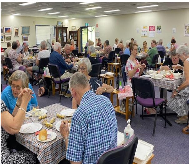
Lots of conversations